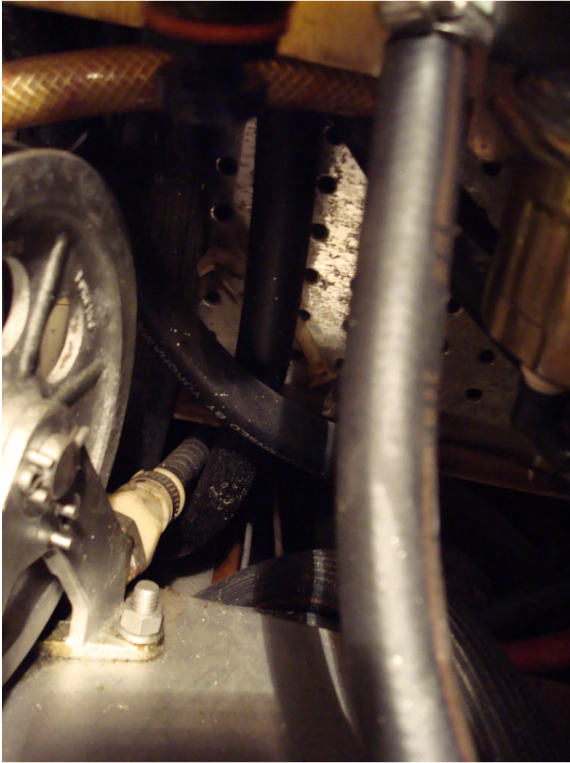
Close up of sheaves, showing cable sleeve mounted on sheave