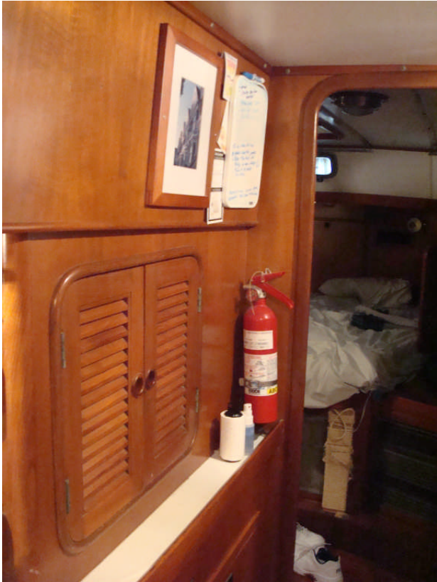
View aft of cabinet aft of galley sink. Galley is on port side