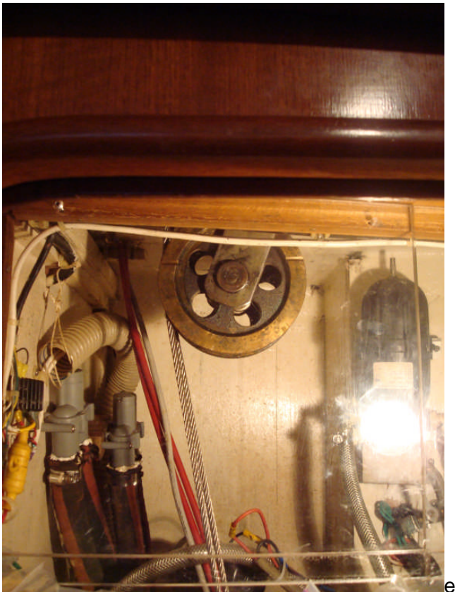
Sheaves mounted behind (inboard) of cabinet. Mounted on top surface below steering pedestal. Turns cables 15 degrees aft.