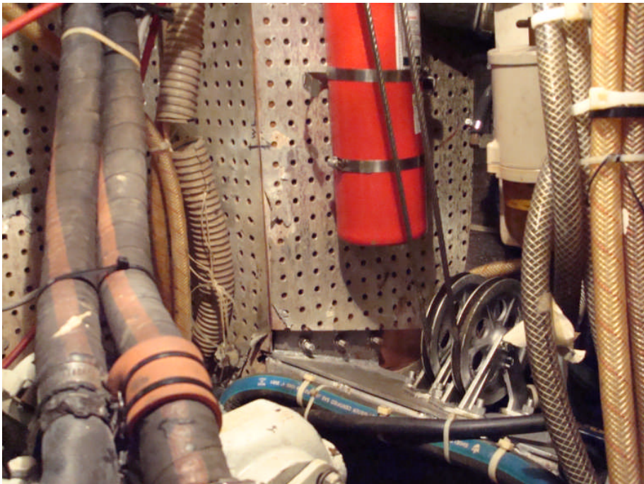
Sheaves aft of engine. Turbocharger visible for perspective