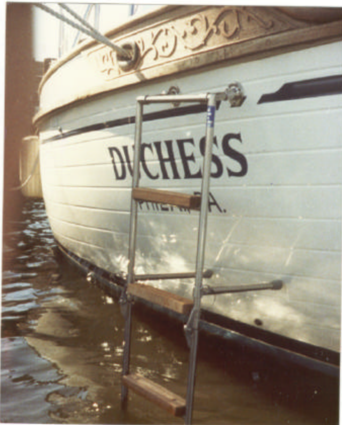
SAFETY LADDER DEPLOYED