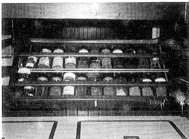
TIGER LILY's fold-down spice rack hinges upward and is secured to the underside of the shelf above with a small locking hasp.

I had seen cookbook holders that had hinges that swiveled down. I designed the rack around some used hinges I found at a lumber store for $5. The rack is 24 in. long by 12 in. wide by 2.24 in. deep. It holds 22 spice bottles that are 1.5 in. in diameter. I made the scalloped edge by cutting 1.75 in. holes in a board, which I then cut down the center. The only negative aspect of the design is that the bottles rattle terribly in a heavy sea. We're trying to combat that by placing pieces of foam inside.