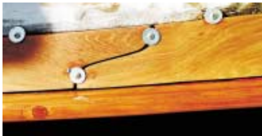
The serpentine margin board joint used for the entire length of the toe rail.