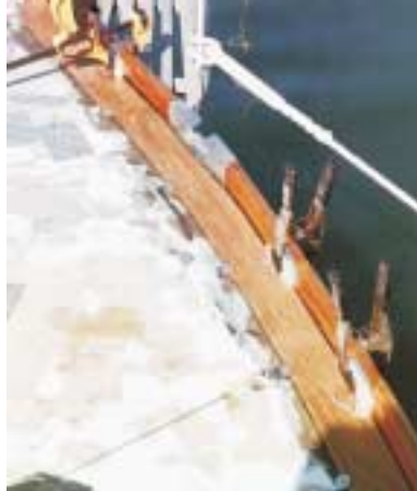
Above right—Clamps and #10 sheet metal screws with washers held the margin boards in place while bonding.