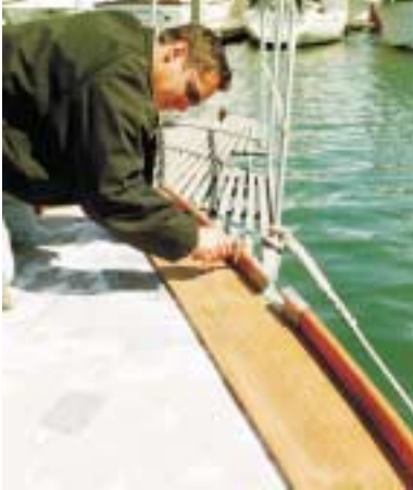
Below—We scribed the curve of the toe rail onto the 8" x ½" x 6' teak board, and cut it to shape with a portable band saw.

Steam bending and dry laying the foredeck required approximately 100 hours (two months of weekend only work) with two people working and numerous beer breaks. We expected bonding the planks to the deck to take the same amount of time.