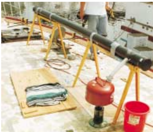
The portable steam tube made from PVC tubing, portable saw horses, gasoline can, duct tape, and a Coleman™ 1500 btu propane burner. This design enabled us to steam four teak planks continuously using two Coleman burners.

Steam bending teak is quite an art. However, for our job which required edge bending \frac{3}{8} " \times 1\frac{3}{4} " \times 12' teak planks, the process is relatively simple. The primary requirement for successfully bending teak planks is to maintain a hot flow of steam across the planks for at least one hour prior to bending. If the steam stagnates inside the tube, it cools and precipitates on the wood, preventing the wood from achieving the temperatures needed to bend. To prevent this, we drilled holes through the tube at 12" spacing to allow the steam to escape. To keep the wood from sitting in the precipitated water at the bottom of the tube, we built elevated platforms for the planks so that the steam could come into contact with the entire surface. Placing 4" bolts through the sides of the PVC tube at 3' intervals provided a simple method for achieving this. For our steam bending, we found that two gallons of water would last for 6–8 hours and consume ap-