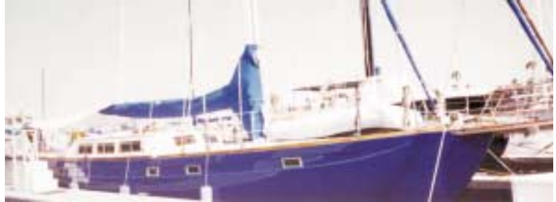
Zatara sitting in her dock in Marina Del Rey before the start of the refit.

Steve and I spent several months stripping away the original hardware, cockpit teak trim, mast, stanchions, doghouse windows and deck non-skid in preparation for laying teak. During this time, we researched every boat building book, web site, and old salt shipwright we could to learn how to lay a teak deck. After all the research and surveys of teak deck owners, we determined that the best method for laying