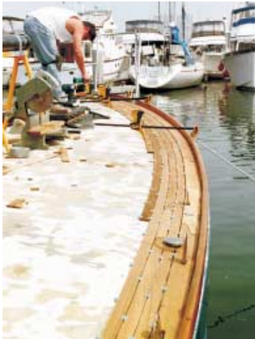
Right top—The Motivator tool bending planks at wider section of the foredeck.