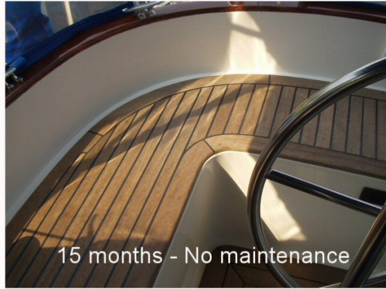
15 months - No maintenance

The cockpit area is covered and stayed dry. The teak oil here will last years.