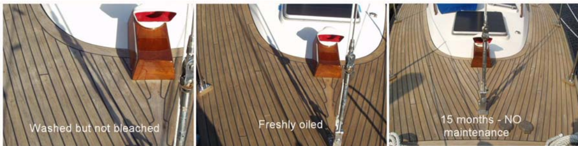
The bow area saw the most sun and weathered more