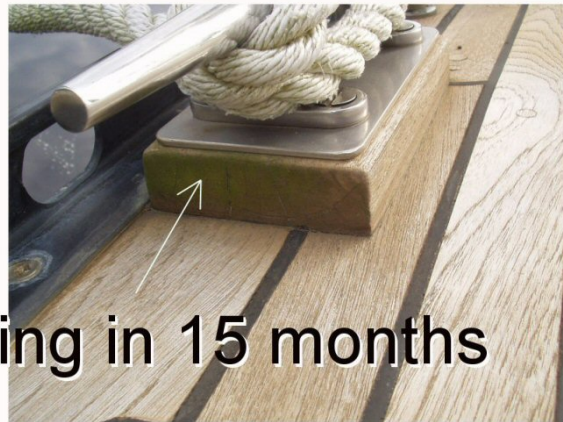
Worst weathering in 15 months