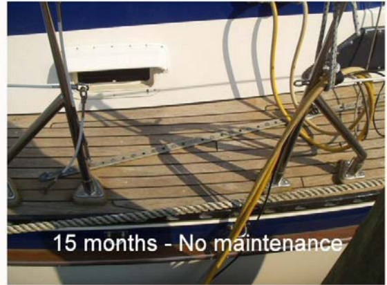
15 months - No maintenance

Walked on at least 5000 times during this test, traffic areas showed almost no wear.